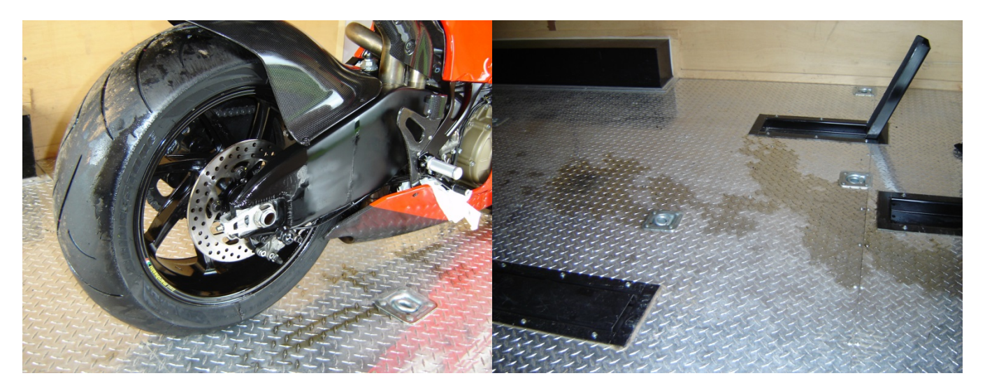
Motorcycle directly after accident in the motorcycle trailer (left). After the motorcycle was removed, synthetic oil was left on the diamond plate floor (right).

As the manufacturer disputed all liability, litigation ensued. The case settled under confidential terms that were satisfactory to the owner. He now rides a new replacement motorcycle.